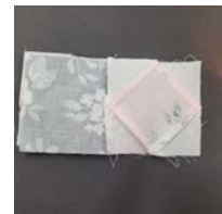
Sew rows together Press