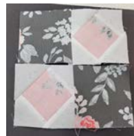
Press towards solid square