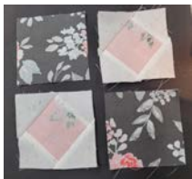
Layout all pieces

You know the system now! Make two blocks and trim them to 3 1/2"